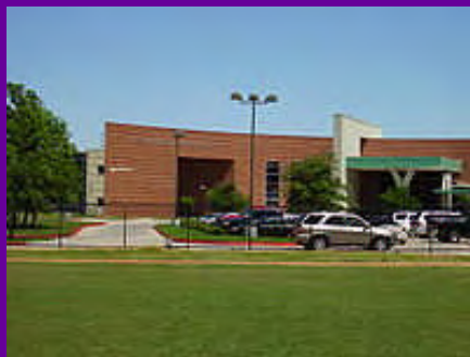
PIN OAK MIDDLE SCHOOL